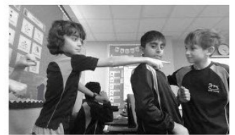
Billeting officer sending children to new home